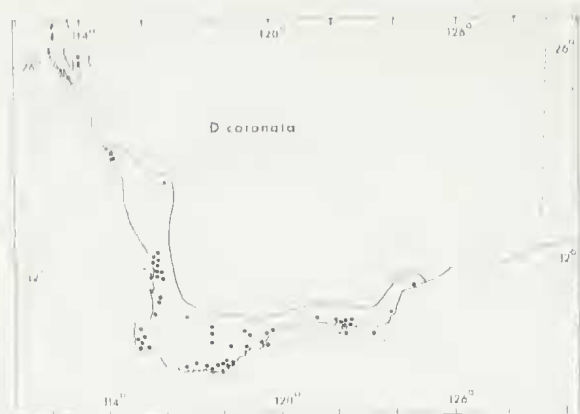
Figure 1 – Map showing distribution of Drysdalia coronata .

Juveniles at birth: snout-vent length 136 mm; tail length 28 mm; total length 164 mm.